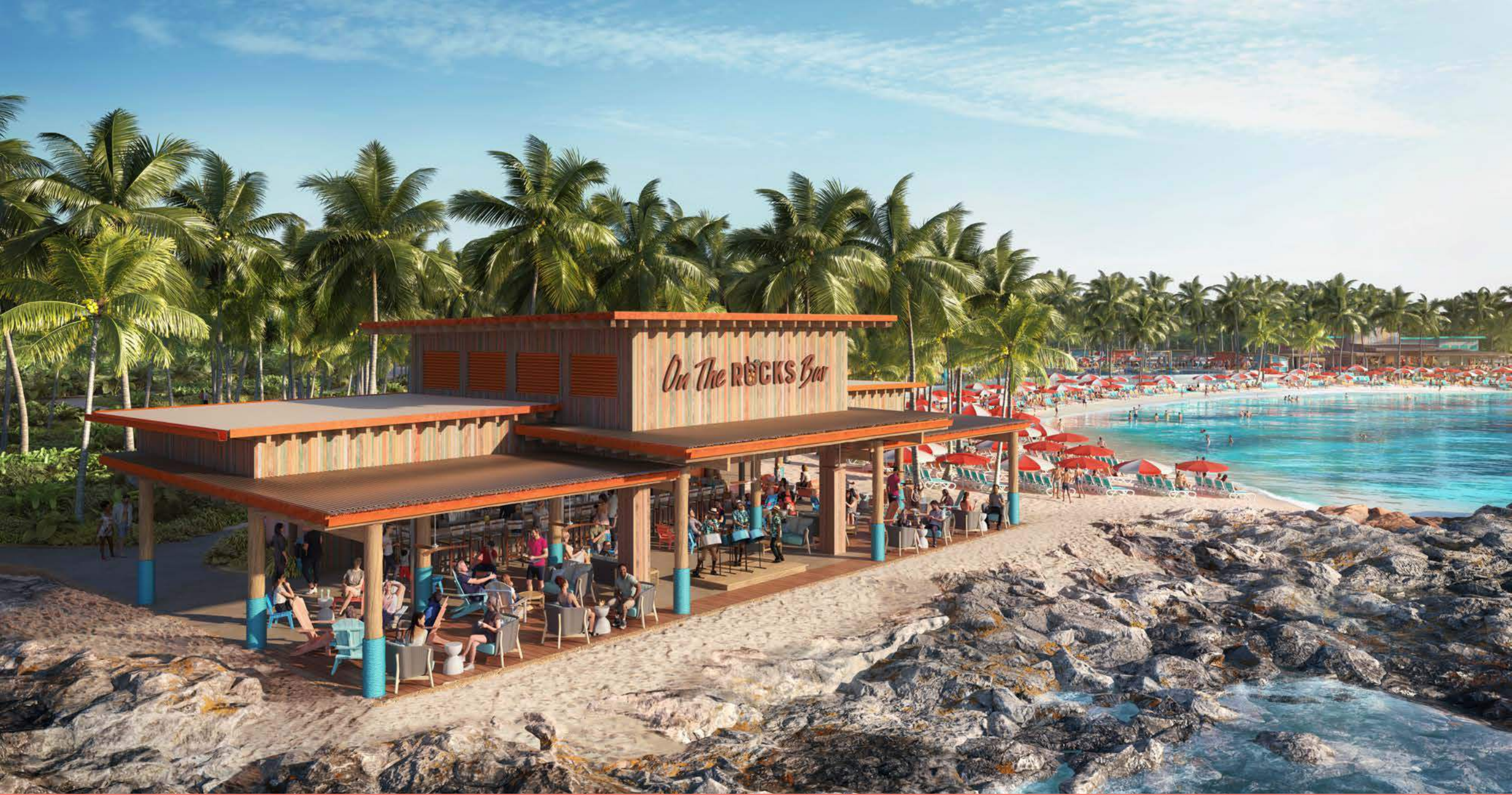
ON THE ROCKS BAR