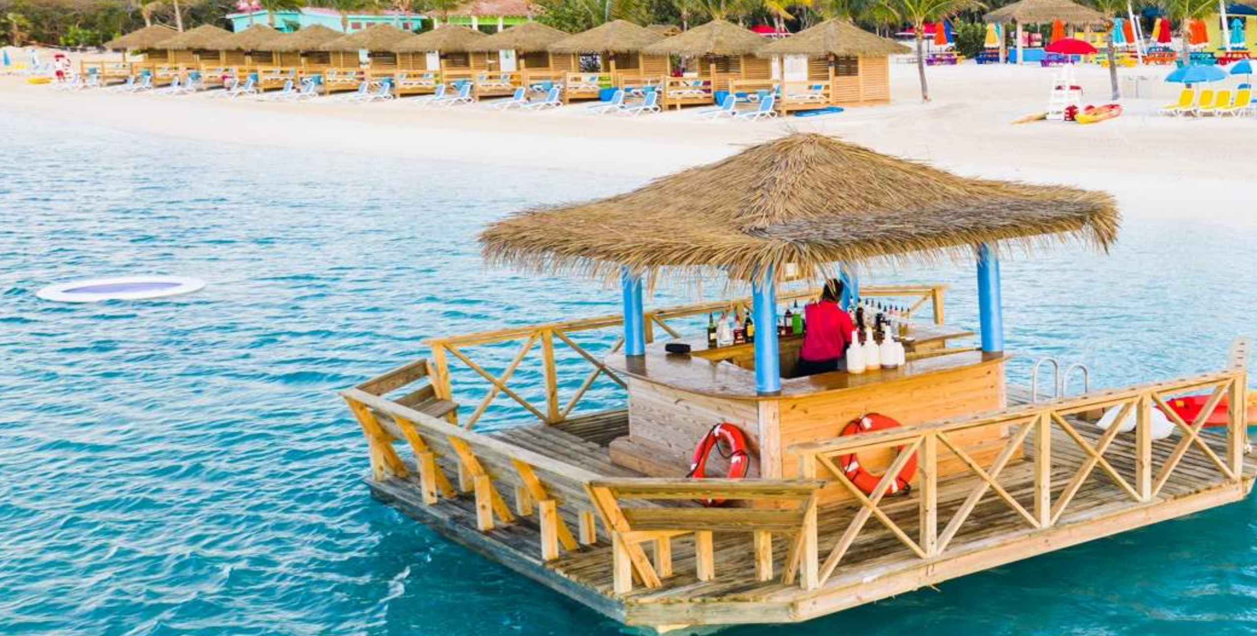
SOUTH BEACH FLOATING BAR