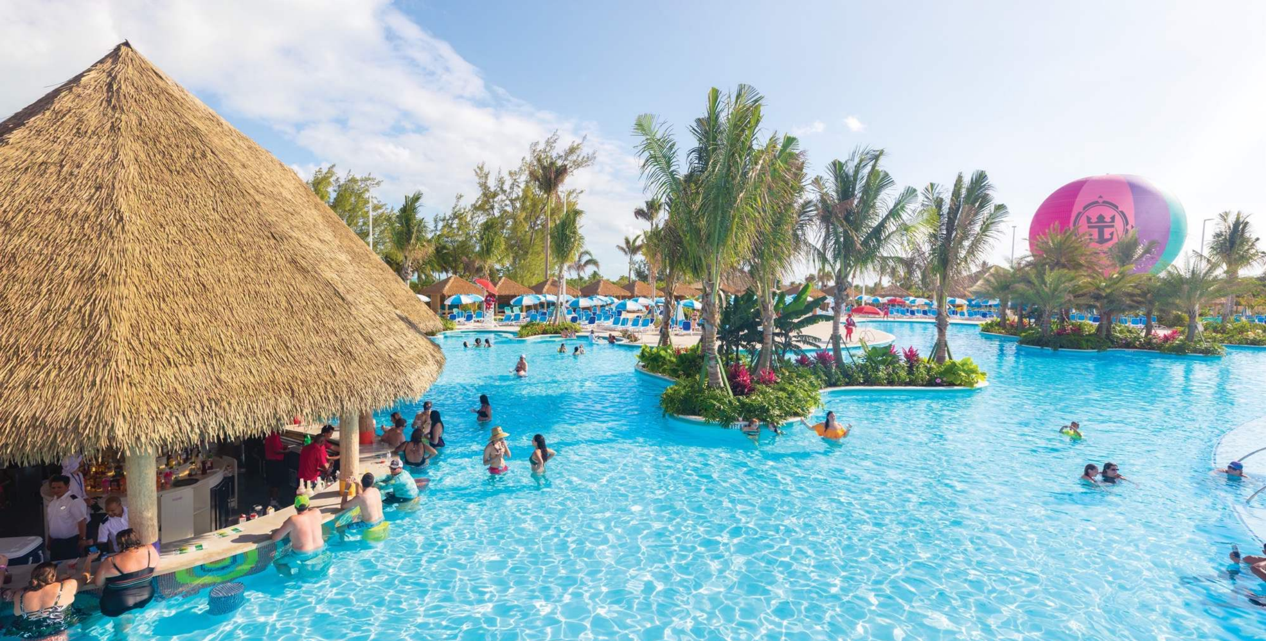
OASIS LAGOON SWIM-UP BAR