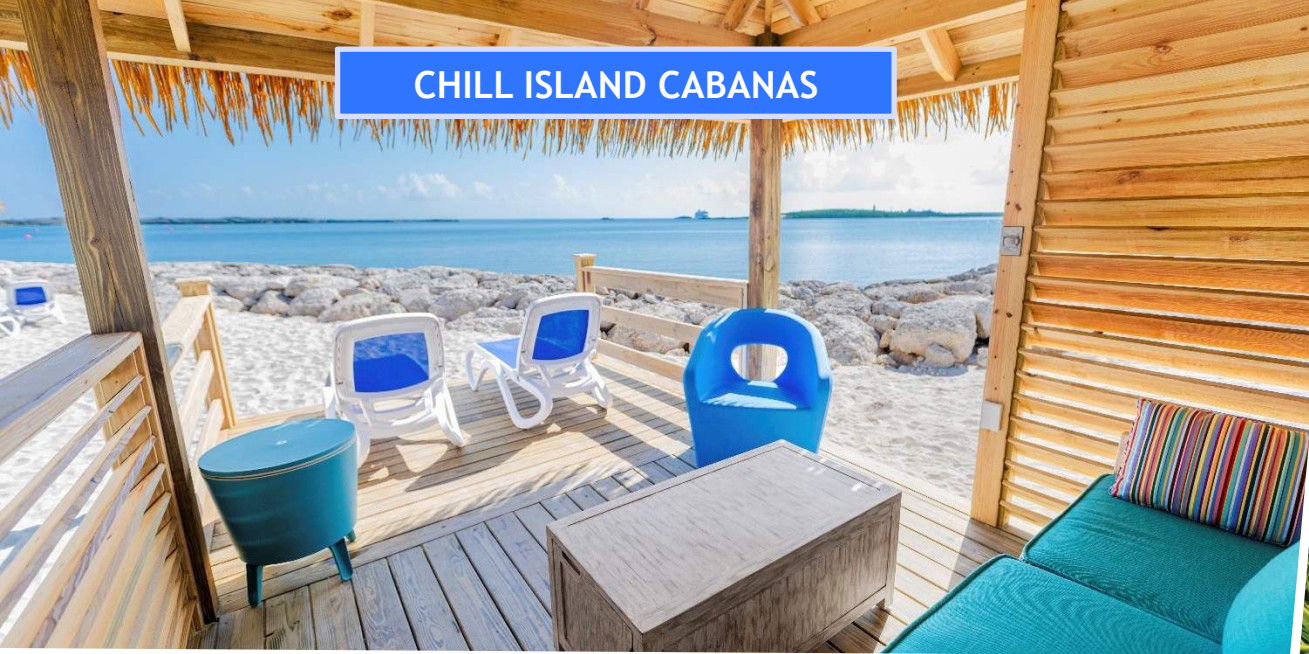
CHILL ISLAND CABANAS