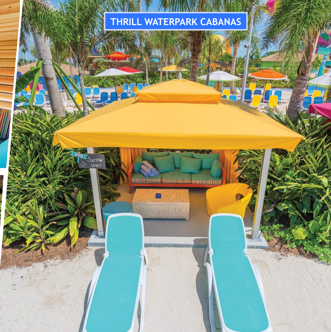
THRILL WATERPARK CABANAS