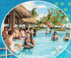
Oasis Lagoon Swim-Up Bar

Share a few cocktails with friends at the swim-up bar or lounge in a private cabana at the Caribbean's largest freshwater pool, Oasis Lagoon.